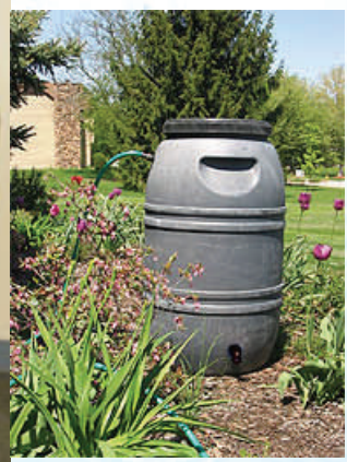
55 gallon Grey Rain Barrel