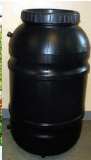
60 gallon Black Rain Barrel