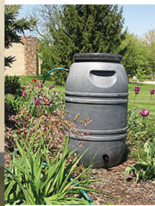
55 gallon Grey Rain Barrel