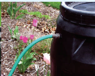
Overflow Hose (Hose not included)