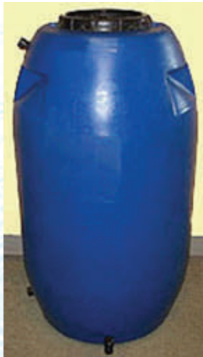
55 gallon Blue Rain Barrel