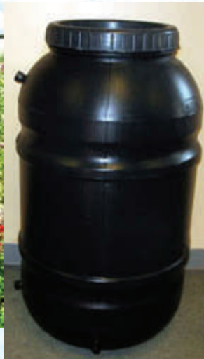
60 gallon Black Rain Barrel