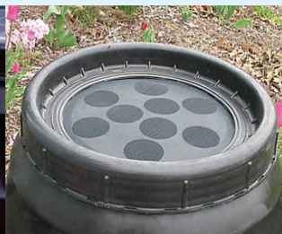
Top Screen View