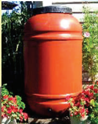
50 or 55 gallon Terra-Cotta Rain Barrel